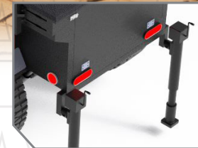
ELECTRONIC BRAKE SYSTEM LINKED TO YOUR VEHICLE

Introducing the all-new Overland Vehicle Systems Off-Road trailer - a true embodiment of versatility, durability, and innovation. Born from the inspiration of military-style trailers, our modernized creation is engineered to conquer the most demanding off-road terrains while seamlessly transitioning into a utility trailer, a motorcycle trailer, or a weekend getaway companion for any outdoor adventure. The Overland Vehicle Systems Off-Road Trailer is not just a trailer; it's a rugged companion built to enhance your outdoor lifestyle. With this trailer in tow, your adventures will know no bounds. Welcome to a new era of off-roading, where capability meets versatility, and the possibilities are endless.