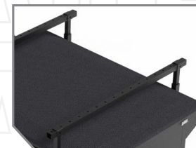
CROSSBARS TO MOUNT RTTS, BIKES, OR ANY GEAR