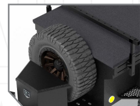
INCLUDES SPARE TIRE MOUNT