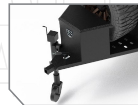
JOCKEY WHEEL FOR EXTRA SUPPORT